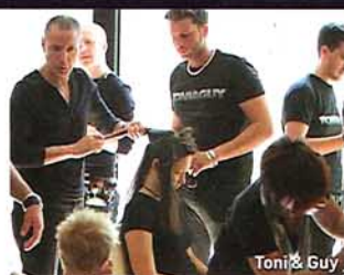
Toni & Guy