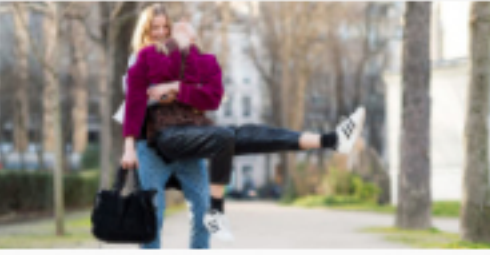
16 SCIENCE-BACKED WAYS TO BE INSTANTLY HAPPIER