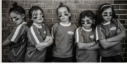
13 PHOTOS PROVING 'STRONG IS THE NEW PRETTY'