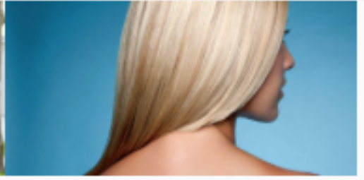
UNLIMITED MONTHLY BLOWOUTS FOR $99 (YES, REALLY)