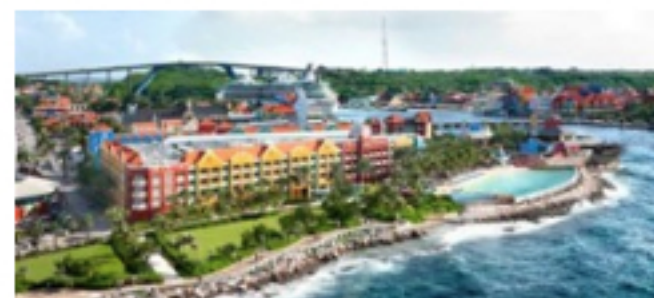
Renaissance Curacao Willemstad, Curacao, Netherlands Antilles