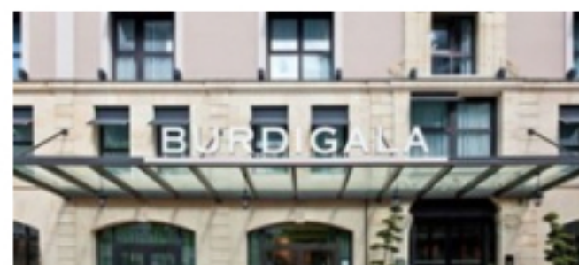
Hotel Burdigala Bordeaux - MGallery Collection Bordeaux, France