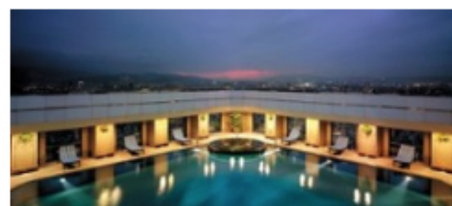
Shangri-La Far Eastern Plaza Taipei, Taiwan