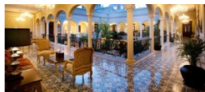
Mansion Merida on the Park Merida, Mexico