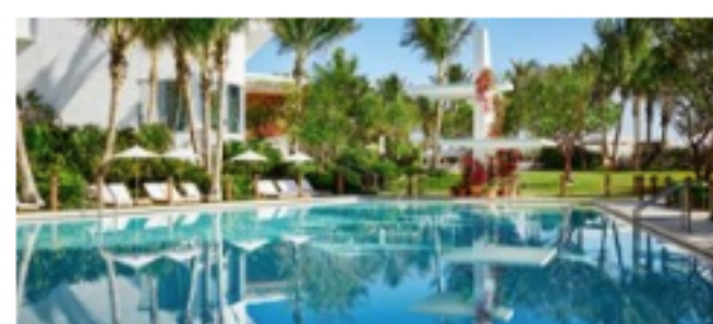
The Miami Beach EDITION Miami Beach, United States