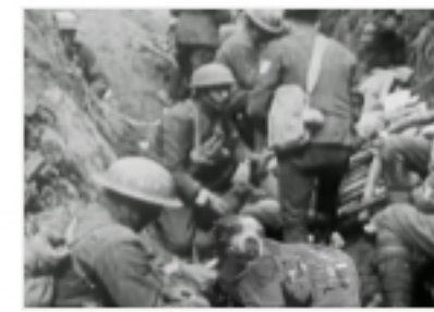
8 Crazy Facts You Won't Learn ...