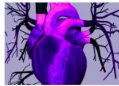
Untrue Facts Your Teacher Taught You