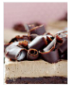
The Caffeinated Table